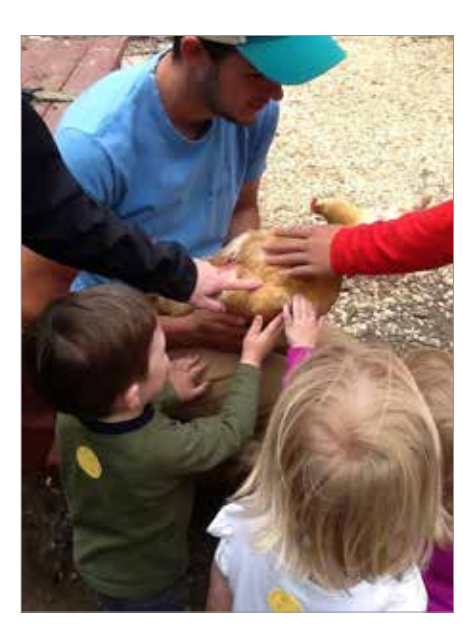
We even got to pet some chickens!