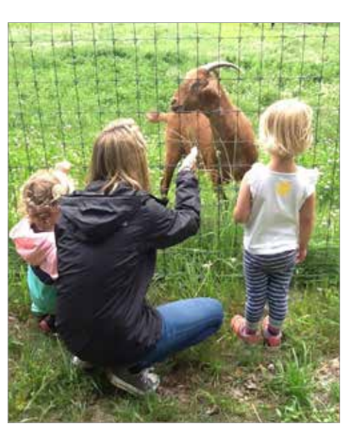
We loved to pet "Butterscotch" the goat!