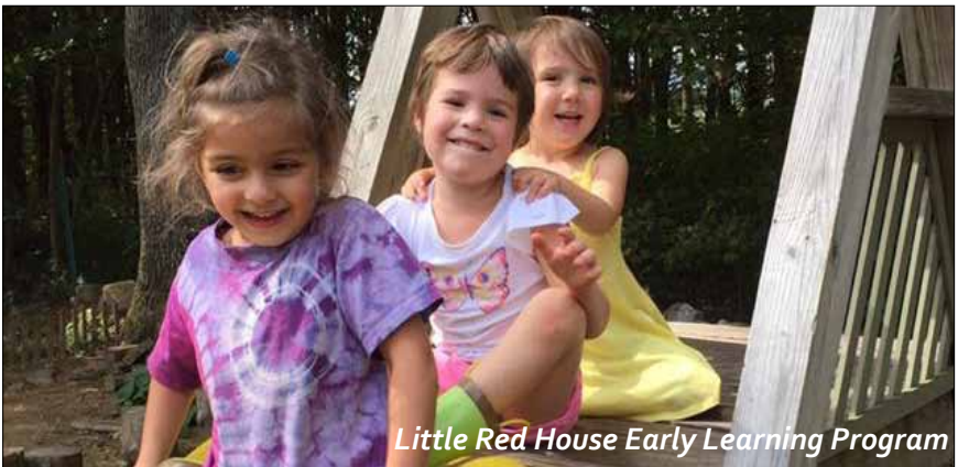
Little Red House Early Learning Program

Kids can stuff their own teddy, decorate a shirt and receive a birth certificate for it. Snack included. Ages 3 and up. Must pre-register by April 14, 802-368-7506.