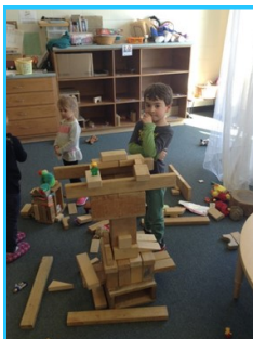
Christian builds a large block structure.